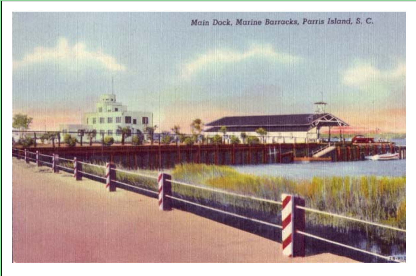
Curteich 2B-H1239: 1942

Main Dock. The Main Dock is located at the east end of the base, adjacent to the original dry dock. Before the causeway was built during World War I, Parris Island was completely separated from the mainland. New recruits arrived by boat at this dock. Today, in 2008, the dock is little used, except for fishing, but appears exactly the same. The street in the foreground is Nicaragua Street, lined with officer's houses facing the water.