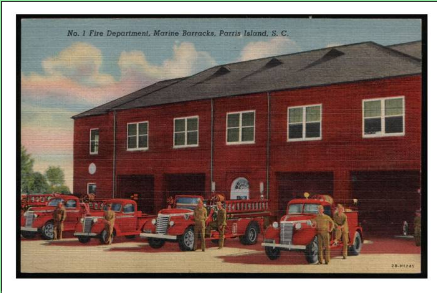
Curteich 2B-H1245: 1942

No. 1 Fire Department. This fire house was constructed in 1941. It stands across the street from the Headquarters Building. When the new fire station was constructed after 1987, this building was converted to the G-4, Depot Logistics office spaces.