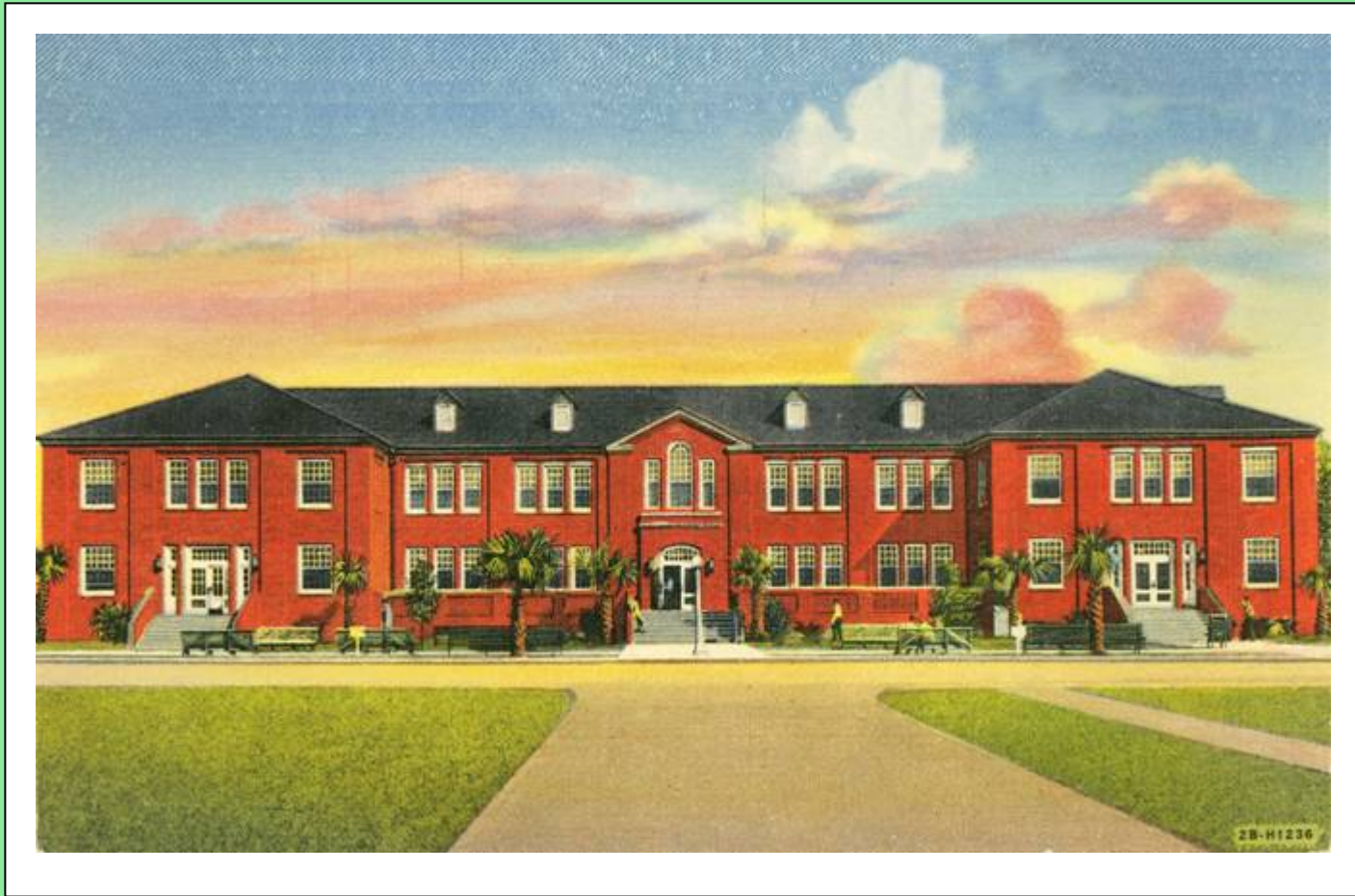
Curteich 2B-H1236: 1942

Main Post Exchange Building. Built in 1941 as the Post Exchange, this building was re-dedicated in 1977 as the Douglas Visitor's Center , named after World War II Marine Senator Paul Douglas. Today, in 2008, it also houses the Library, the Book Store, the Base Photography Office, and the Public Affairs Office.