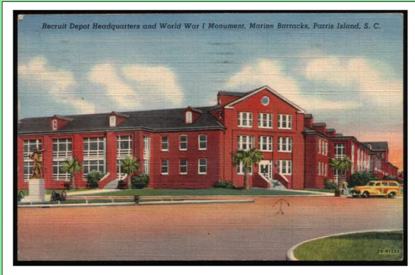
Curteich 2B-H1243: 1942