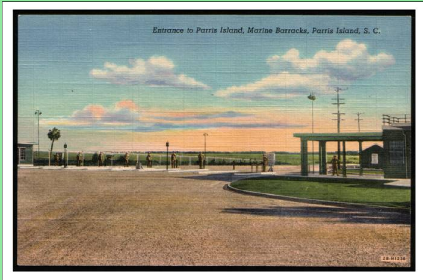
Curteich 2B-H1238: 1942

Entrance to Parris Island. The main gate provided access across the single causeway leading to Parris Island. The second causeway was not built until after 1987. The well-known and distinctive red brick entrance sign to Parris Island, that welcomed over one million recruits between 1943 and 2001, was not yet built.