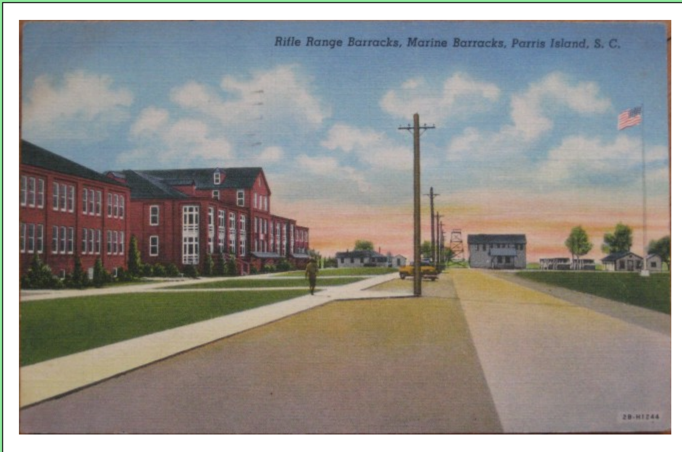
Curteich 2B-H1244: 1942

Rifle Range Barracks. The brick Rifle Range Barracks were built at the beginning of World War II. The extensive Parris Island rifle ranges are off to the right. The white wooden buildings at the water's edge hide a view of Hilton Head island. Today, in 2008, the white buildings are no longer there.