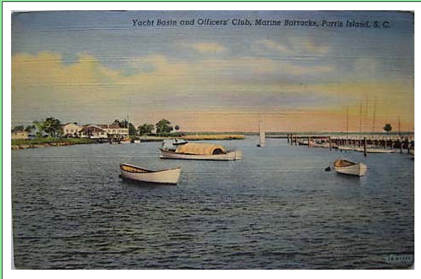
Curteich 2B-H1237: 1942

Yacht Basin and Officers' Club. The Yacht Basin is located near the officer's housing area. Today, in 2008, the Yacht Basin is too shallow to use, having been silted up over the years. The building in the background is the Officer's Club. The original club building, dating from 1918, was moved in 1939 from a location adjacent to the Lyceum to this location at the Yacht Basin. This same club, with only minor renovations, is known today in 2008, as Traditions .