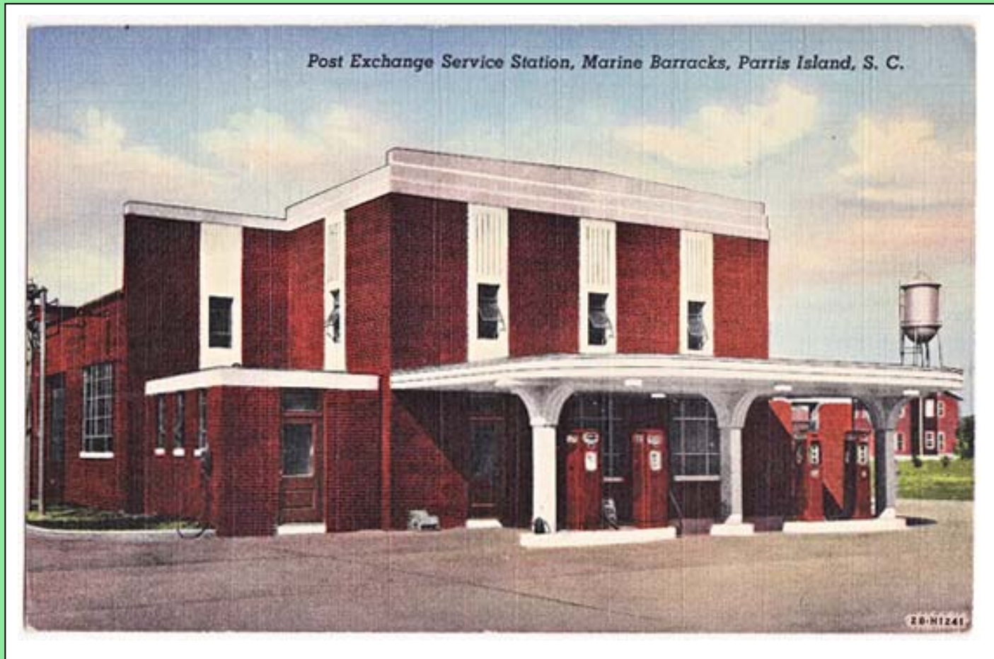
Curteich 2B-H1241: 1942

Post Exchange Service Station. This World War II Post Service Station is now, in 2008, the location of the Medical Center. The silver water tower on the right appears in other images beyond the parade deck.