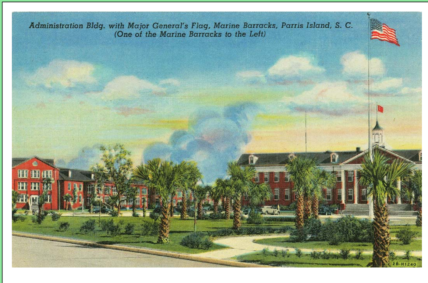
Curteich 2B-H1240: 1942

Administration Bldg. The Depot Headquarters Building was built in 1941. The general's office was then moved from the Old Headquarters Building next to the Lyceum. It was called the "Post Headquarters Building" until "Depot" became the official name for Parris Island in December 1946. At left is the Headquarters & Service Battalion Building, built in 1938, and used during the war as Recruit Training Headquarters. Today, in 2008, the newly planted oak and palm trees in the foreground are all fully grown, blocking this view entirely.